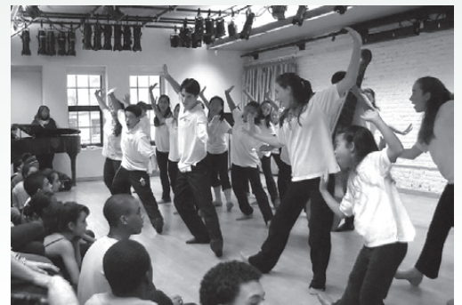
The Stars perform for Rosie's Broadway Kids.