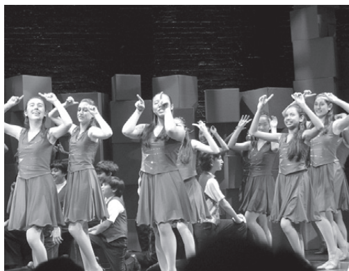
Performing for family, friends and new friends at The Minetta Lane Theatre.

The shows were great inspiration for what was to come on the following day, when the