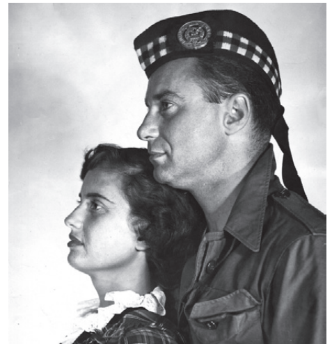
Former Hawaii governor William F. Quinn in Brigadoon .