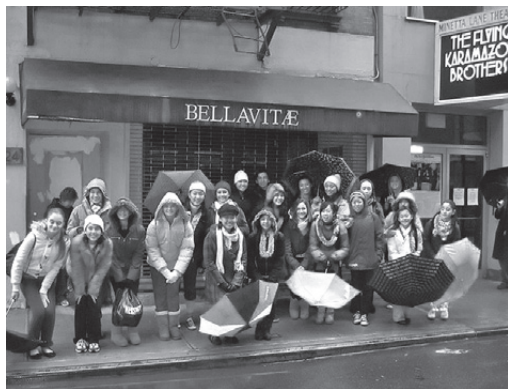
In front of The Minetta Lane Theatre in New York City.

After almost a year of fundraising, 39 Shooting Stars—plus our Stars staff and an army of chaperones, parents, siblings, aunties, uncles and grandparents—took off in March for a one-week tour of New York City.